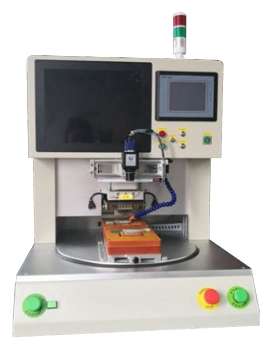
HBS-2MA Can handle PCBs up to 180*200mm *2pcs

HBS-2MA Hot Bar Soldering Machine use thermode technology that based on repid reflow by pluse heating to effectively solder flexible board on the PCB. Real time display on the touchscreen. Can use CCD+displayer can accurate positioning and soldering quality check. The Z axisis controlled by a stepper motor and can be preset to soldering pressure. Rotating double soldering stations with high soldering efficiency.